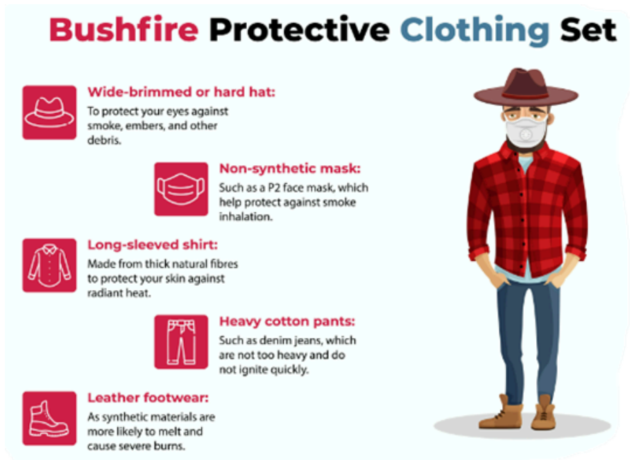
Figure 1: Australia wide first aid protective clothing bushfires

Head to the RFS website for more information What to wear