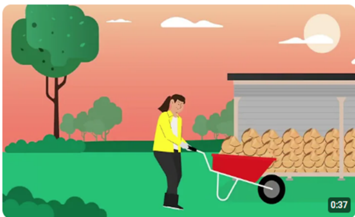
Watch: NSW RFS – Don't Give fire A Chance