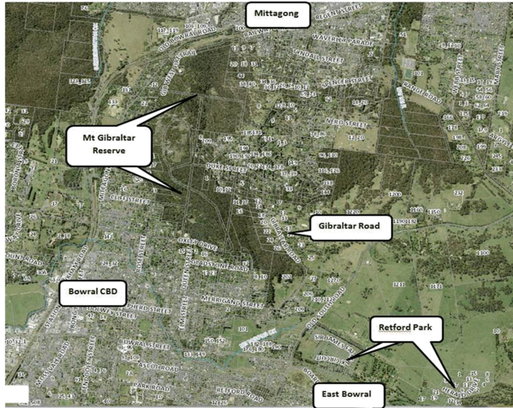
Figure 1 – Location of Gibraltar Road