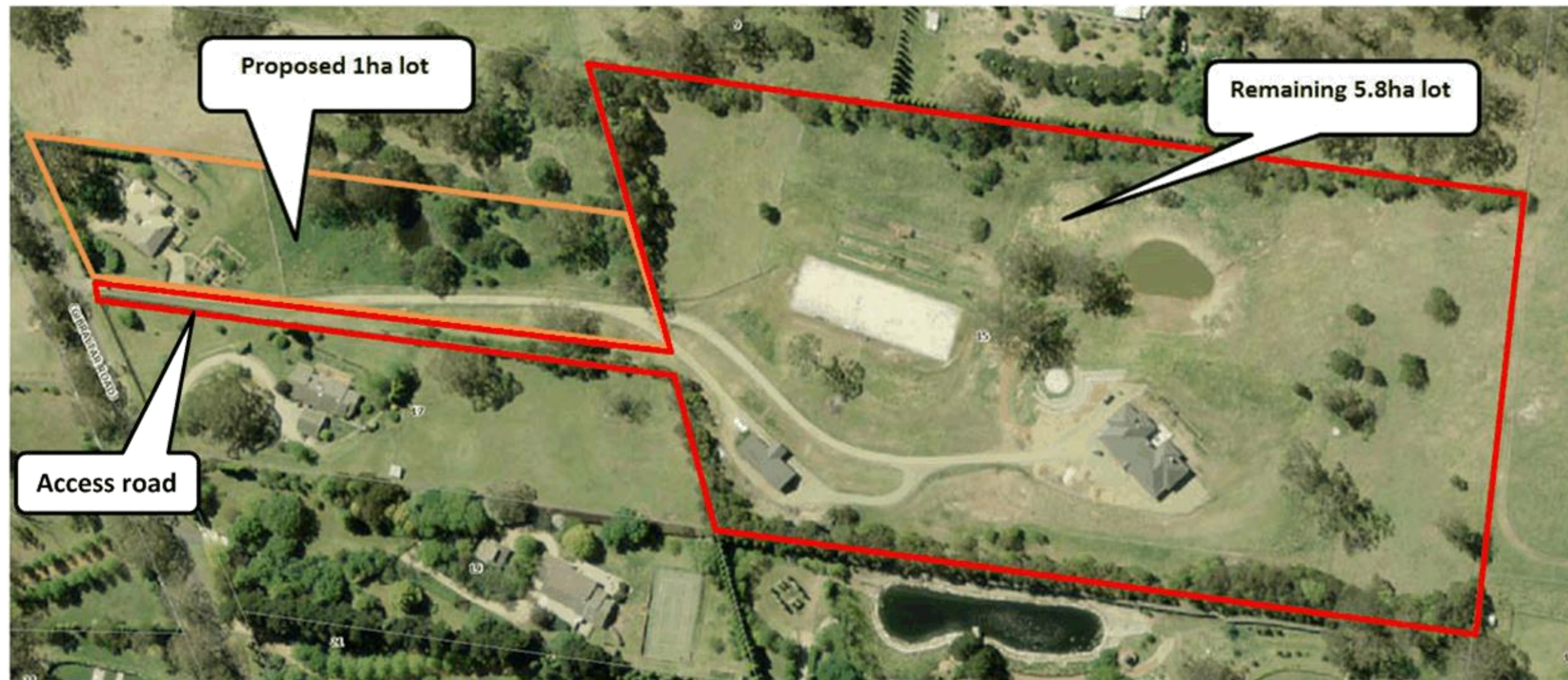
Figure 5 – Proposed 2 lot Subdivision