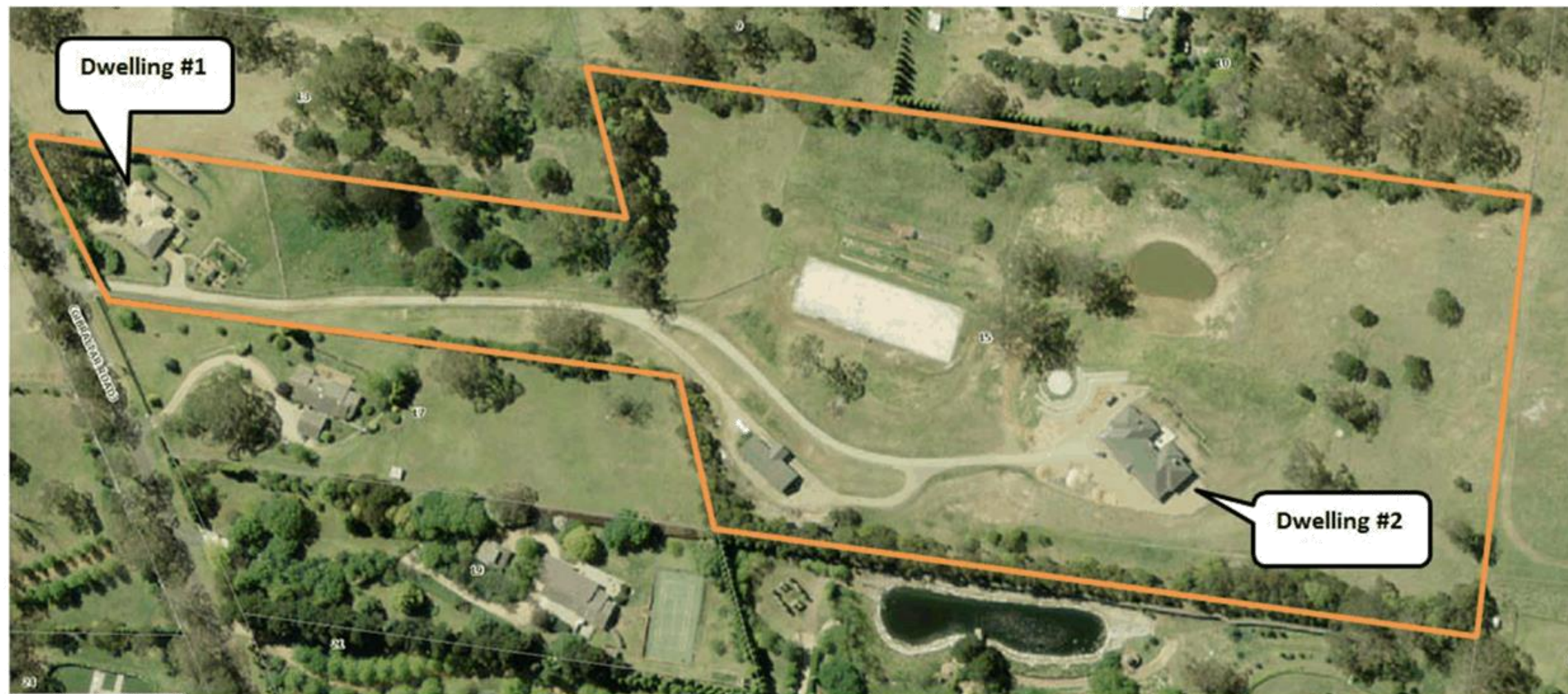
Figure 4 – Subject Land and Dwelling Locations