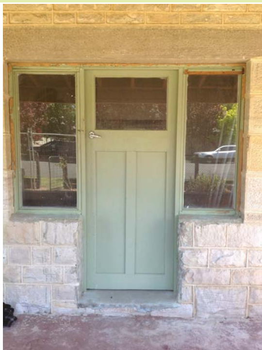
Before project photo: showing door cut into window opening