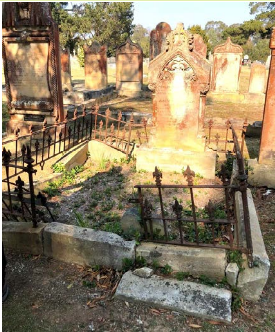
After project photos: