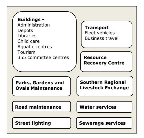
Figure 2. Reporting boundary

boundary is not currently available. Data quality management plans are in place for priority sources identified. Sources will progressively be included based on their relevance, materiality, and measurability.