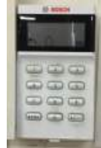
Alarm pin pad