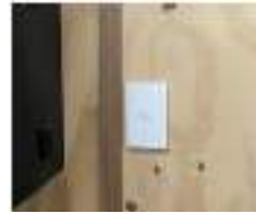
1. switch next to the rack