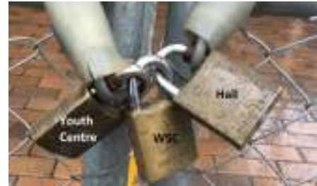
Padlocks for gate