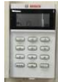
Alarm Pin Pad