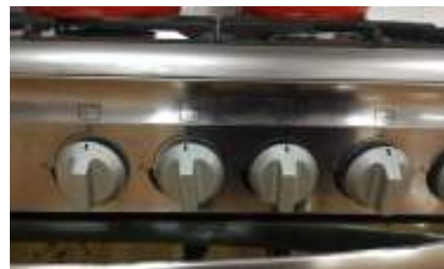
Hot plate knobs.