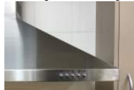
Range hood and buttons for the exhaust fan and light.

Note: Please bring cleaning products as well as cleaning cloths, tea towels and paper towels to assist with your cleaning.