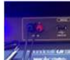
4. blue and red RCA cables